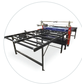
Horizontal laminator: I-Walco