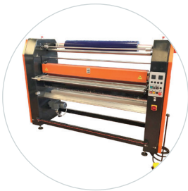
Horizontal laminator: Pro-jet

Novacel offers application machines for all your needs: standard laminators with manual cutting: « Pro-Jet » and « I-Walco ».